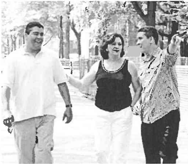
The Rivera Family at Nostrand Houses