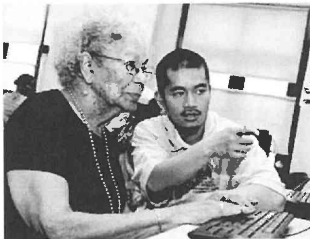
Broadband Technology Opportunities Program Computer Class at Astoria Houses Community Center

A total of 599,493 New Yorkers are served by NYCHA's Public Housing and Section 8 Programs. If NYCHA was a city, it would rank 31st in population size in the United States, with New York City ranked first (as per July, 2014 U.S. Census Estimate). Based upon the 2014 NYC Housing and Vacancy Survey (HVS), NYCHA Public Housing represents 8.1 percent of the City's rental apartments and, based on the July, 2015 Census Estimate, is home to 4.7 percent of the City's population.