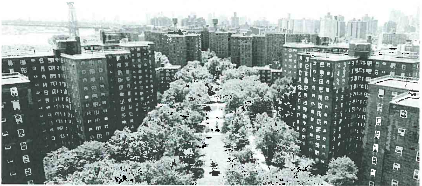
Jacob Riis Houses